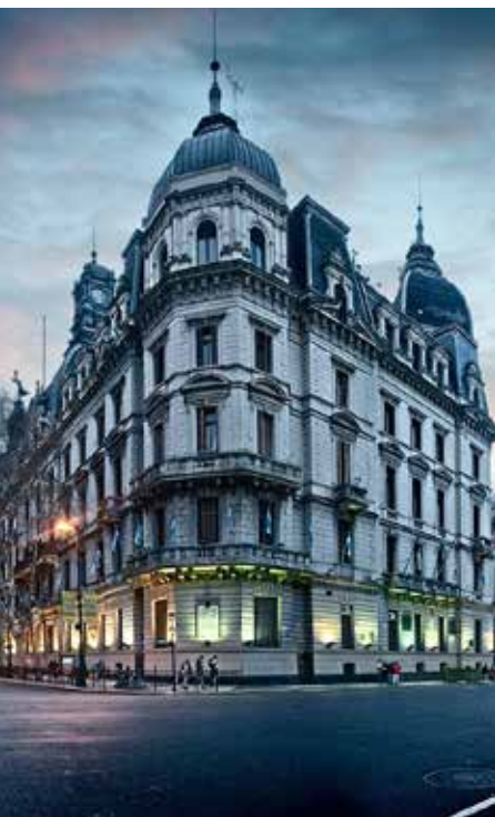
Legislature of the City of Buenos Aires

We are the only advisory firm with a 360 professional approach to land and develop businesses in Argentina. Our integrated platform guarantees speed to market, methodology and expertise to accelerate results: focus, simplicity, coherence, synergies, coordination, a comprehensive view and leadership, are some of the benefits that this holistic approach will bring to your company.